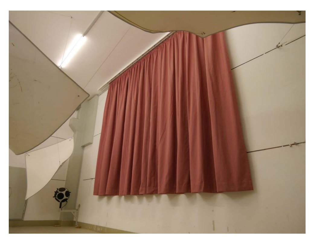
Figure B.2. Test arrangement in the reverberation room (diagonal view).