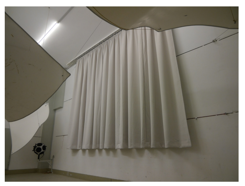
Figure B.2. Test arrangement in the reverberation room (diagonal view).