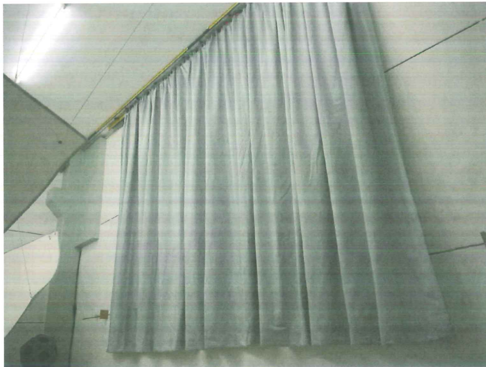
Figure B.2. Test arrangement in the reverberation room (oblique view)