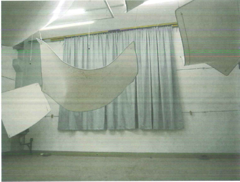
Figure B.1. Test arrangement in the reverberation room (total view)