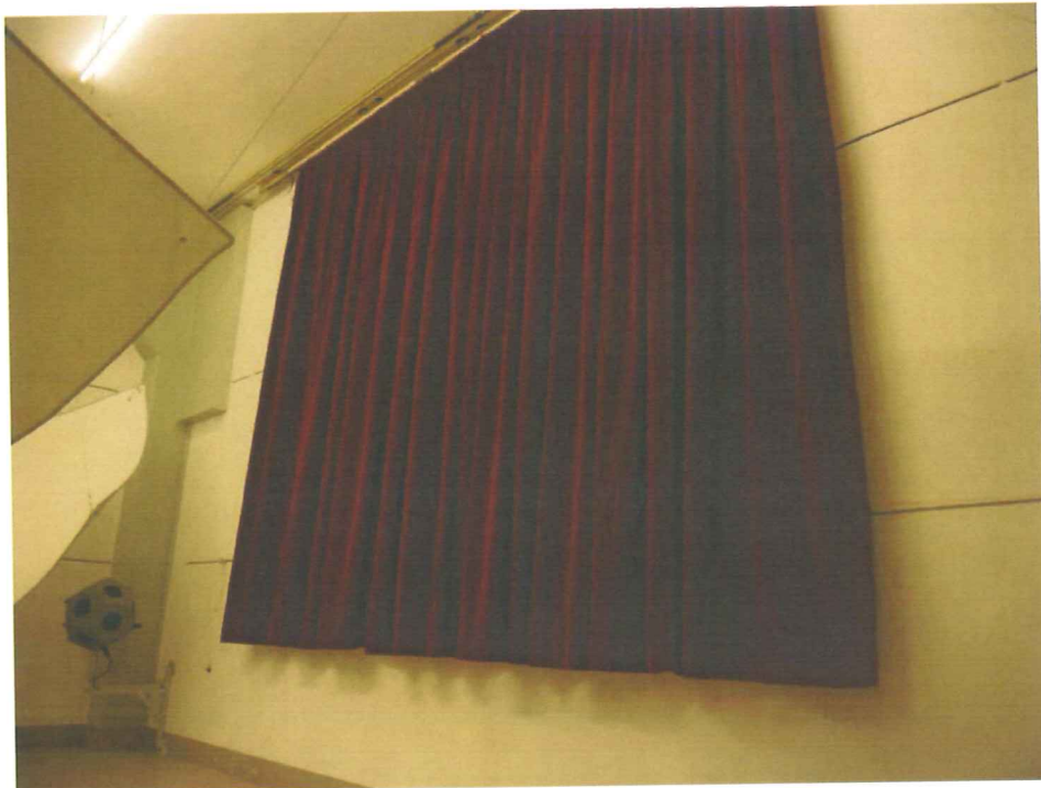
Figure B.2. Test arrangement in the reverberation room (diagonal view).

S:\MProj\076\M76176\M76176_15_PBE_1E.DOC : 25. 11. 2014