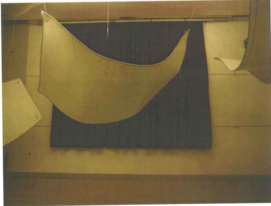
Figure B.1. Test arrangement in the reverberation room (total view).