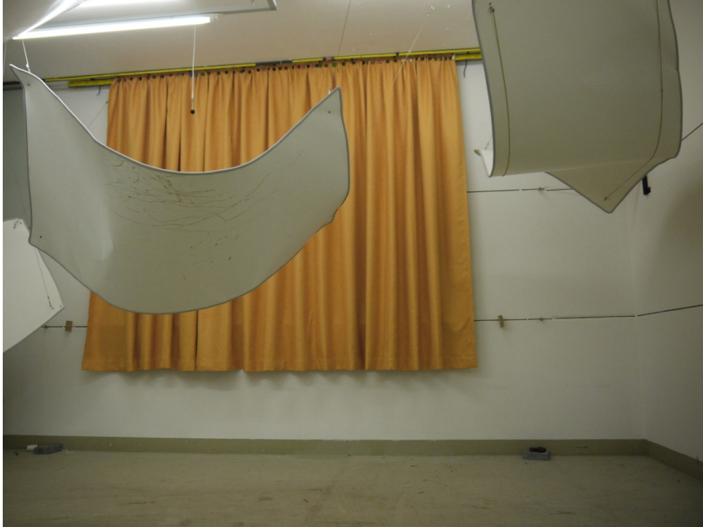
Figure B.1. Test arrangement in the reverberation room (frontal view).