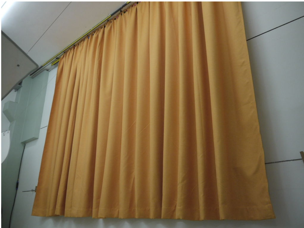
Figure B.1. Test arrangement in the reverberation room (diagonal view).

\\s-muc-fs01\AlleFirmen\Proj\076\M76176\M76176_04_PBE_1E.DOCX : 28. 06. 2018