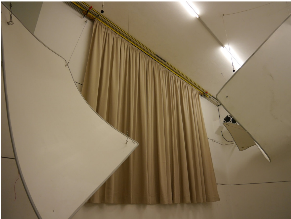
Figure B.2. Test arrangement in the reverberation room (diagonal view).

S:\IMP\Proj076\M76176\m76176_24_pbe_1e.DOCX : 17. 10. 2017