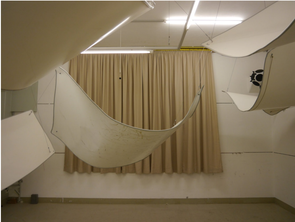
Figure B.1. Test arrangement in the reverberation room (frontal view).