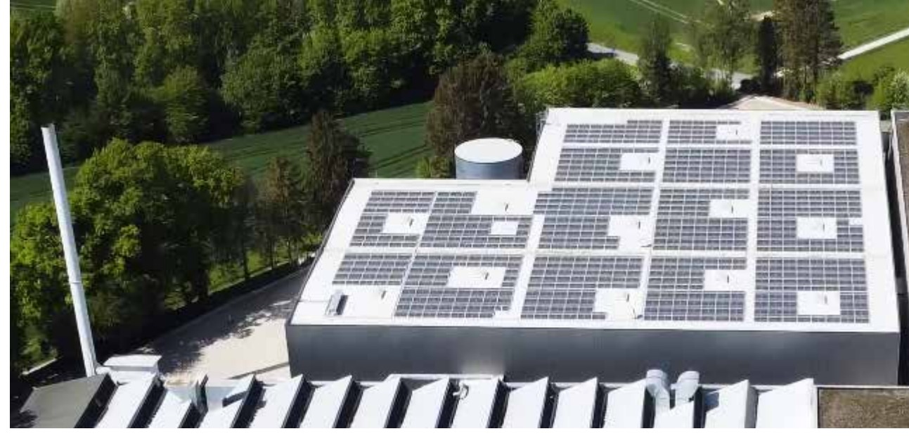
Photovoltaic system on new DELCOTEX hall in Jöllenbeck

For the DELIUS Group, sustainability means taking responsibility: for our employees, for our region and especially for our environment and the climate. Because climate protection also means leaving a liveable environment for the next generation which is particularly close to our hearts as a family-run manufacturing company. The Corona pandemic has not left us unscathed and has once again made it clear to us that a company must not build on short-term success, but rather on long-term and solid business practices with stable customer and supplier relationships.