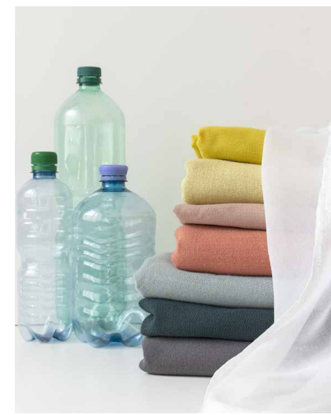
EcoLine curtain fabrics made from recycled PET bottles