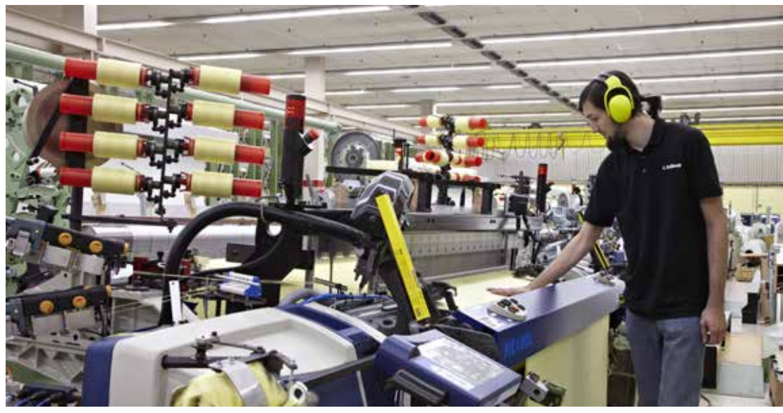
DELCOTEX weaving mill in Jöllenbeck

The DELIUS Group is committed to a healthy working environment within the framework of occupational health management (OHM), protects health and ensures occupational safety in order to prevent accidents and injuries.