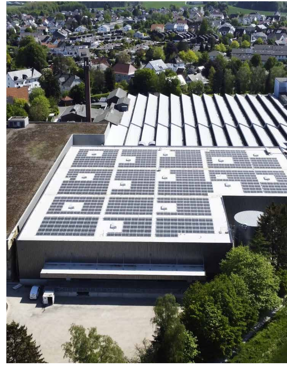
Photovoltaic system on new DELCOTEX hall in Jöllenbeck