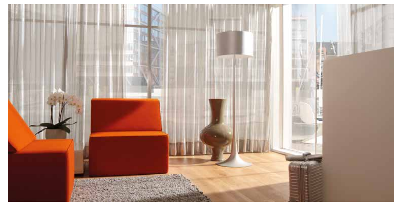
Energy-efficient DELITHERM curtain fabrics from DELIUS