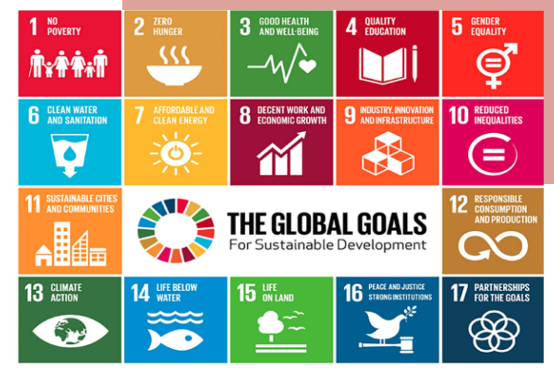
Global Goals for Sustainable Development der UN